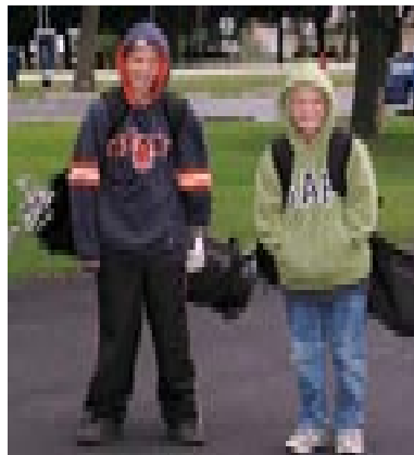
The first to arrive.

to accommodate this many golfers, we had to have two shotgun starts. The first of these was to start at 7 AM. When we first heard of that time, we thought, "Yeah, right." Well, it meant getting there before 6 in the morning for set up, as well as the golfers checking in prior to tee off. Well, it wasn't quite 7 that the signal was sounded for all to hear, telling them to begin, but it was pretty close to it.