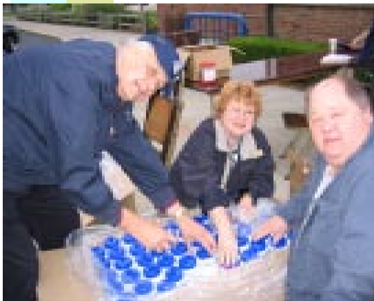
Optimists screwing the lids onto the water bottles.