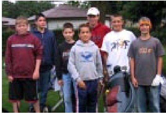
We live to golf!