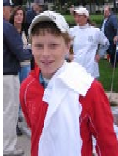
He's been here every year.