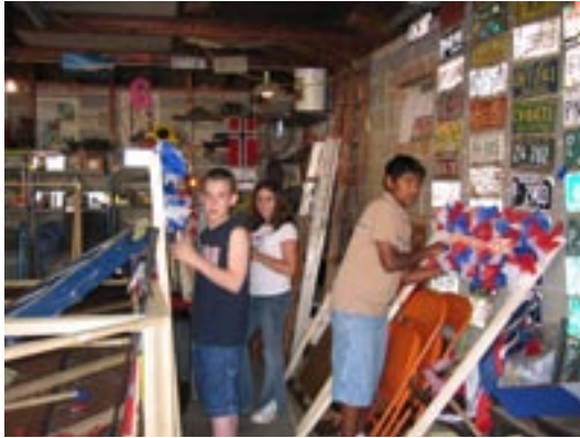
Float Construction by JOOI Club