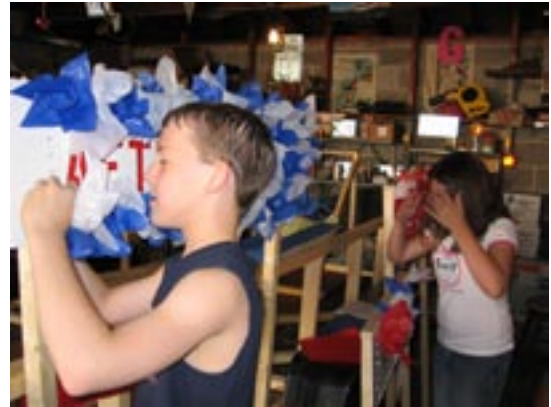
Stuffing the tissue paper