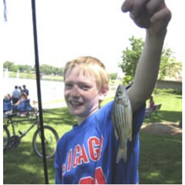
The smile tells it all