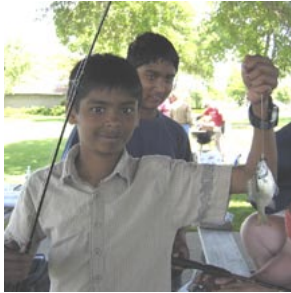
My first fish