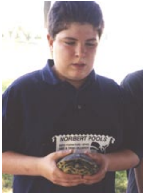
First catch of the day