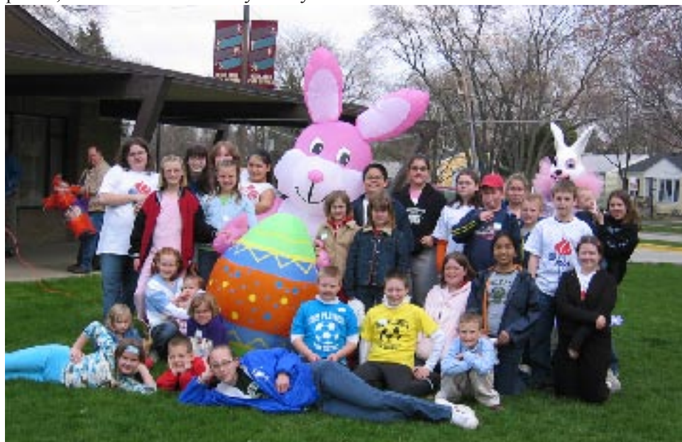
A Spring Celebration