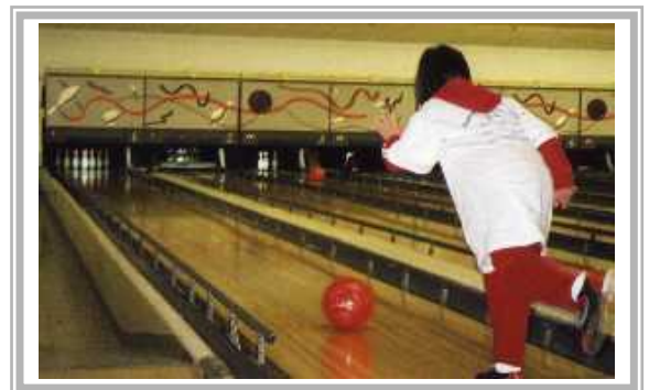
Doesn't look like she needs those bumpers!

As we look forward to the spring and summer, our busiest season, we have so many opportunities to share Optimism with youth and their parents. Let's share, with them, the pride of our HONOR by supporting these activities.