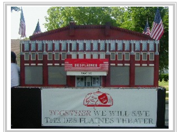
“Save the Theater” float from the Fourth